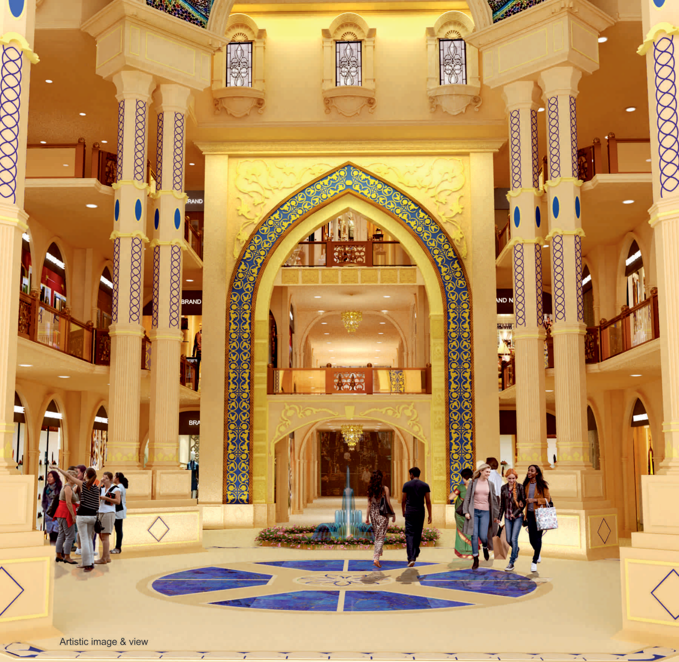
Artistic image & view